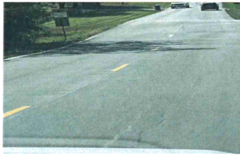
Virginia from 144 th to NE Amory