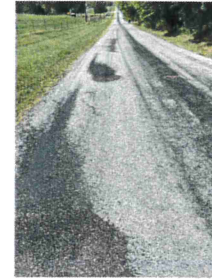
144 th from Wise Rd . To Virginia